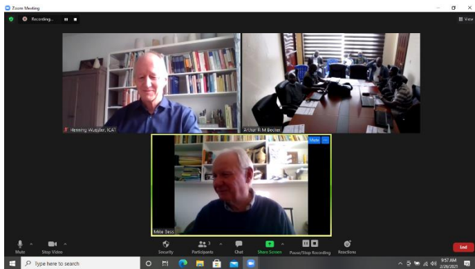
ICAT Team connected with the Liberia team during the inception meeting