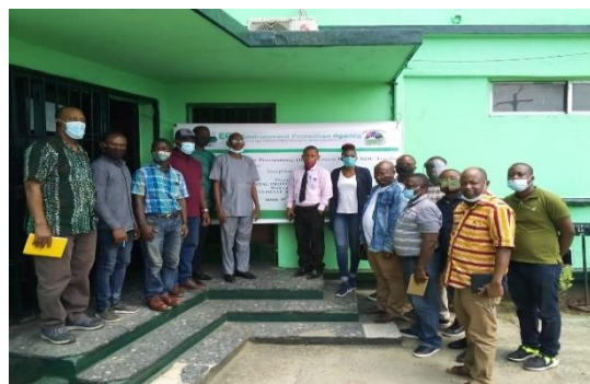
Group photo of sector experts