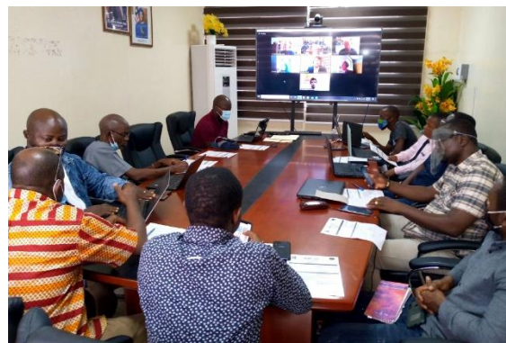
Cross section of sector experts at the inception meeting