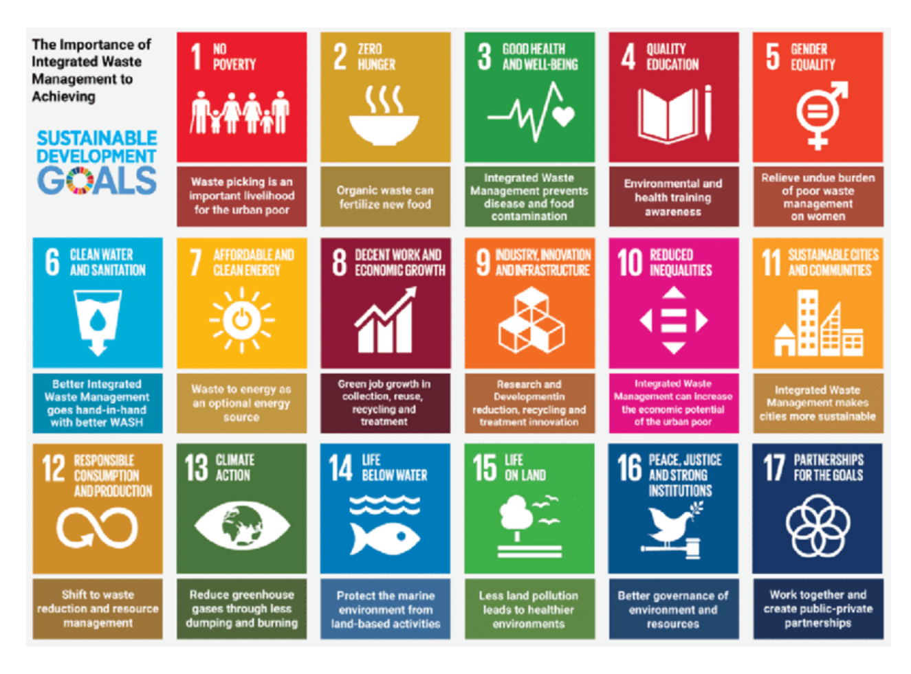
Figure 1-1: Sustainable Development Goals and Integrated Waste Management

Source- "Small Island Developing States Waste management Outlook" Publication by Jeff Seadon, Auckland University of Technology [2]