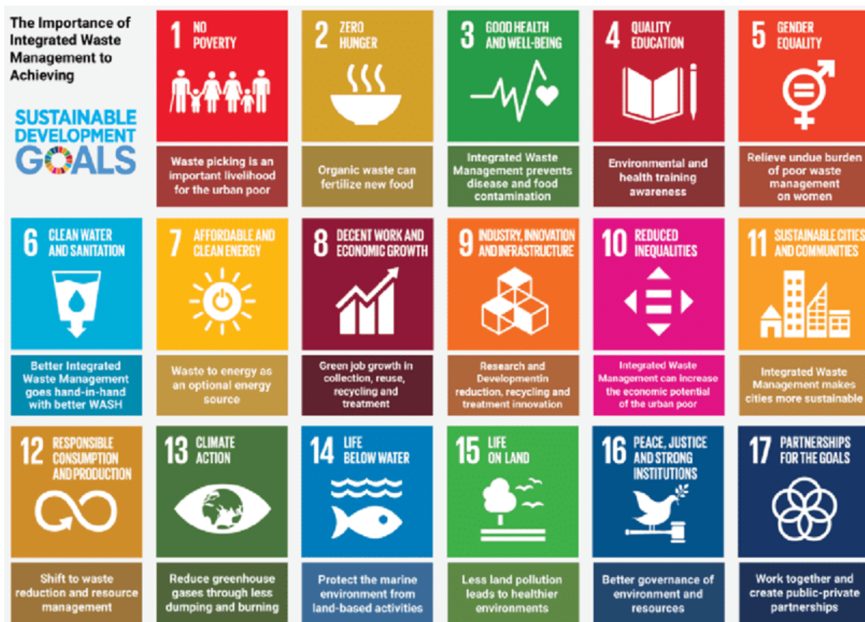
Figure 1-1: Sustainable Development Goals and Integrated Waste Management