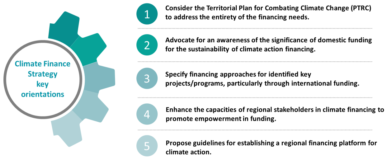
Figure 3. Climate Finance Strategy key orientations for the implementation of the PTRC.

The current climate financing strategy revolves around five key orientations, as follows: