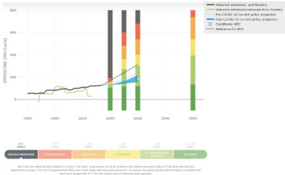
Figure 3 Ethiopia GHG emission projections ( https://climateactiontracker.org/countries/ethiopia/ )

According to Climate Action Tracker Ethiopia is making progress reducing emissions significantly. However, the current projection is that emissions in 2030 will be between 155-219 MtCO 2 e with an expected mean around 185MtCO 2 e. This projection is based on a revised outlook for economic growth which is expected to slow due to COVID-19. The pre-COVID-19 projection for emissions was 239MtCO 2 e for 2030 – that is 22% higher than the mean for post-COVID-19.