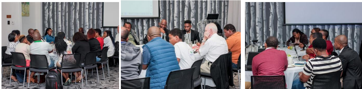
Figure 9: sections of the break-out groups

The second day of the workshop was planned to be half a day and largely focused on technical consultations and stakeholder engagements in the three groups; water, health and bioenergy. The breakout sessions were led by team leads from UNESWA/CSER. The morning session was opened by Dr Mavimbela who further provided guidance for the breakout groups. The breakout groups were set up to go into more depth, including discussions on MRV arrangements for adaptation in the health and water sectors, and also the setting up of the bioenergy task force. The participants in the workshop were informed that a reporting back session would follow the breakout session. Participants of the workshop were requested to join their relevant groups namely; water, health and bioenergy .