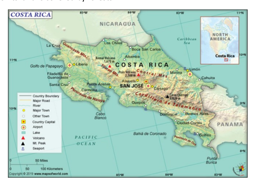
Figure 1. Map of Costa Rica.

Costa Rica is located in the Central American Isthmus and shares borders with Nicaragua, on the north, and Panama, on the south (Figure 1). The total area of Costa Rica is 51,100 km², and the population is around 5 million, as of 2020. The country is characterised by a tropical climate and more than half of its land is covered by forests.