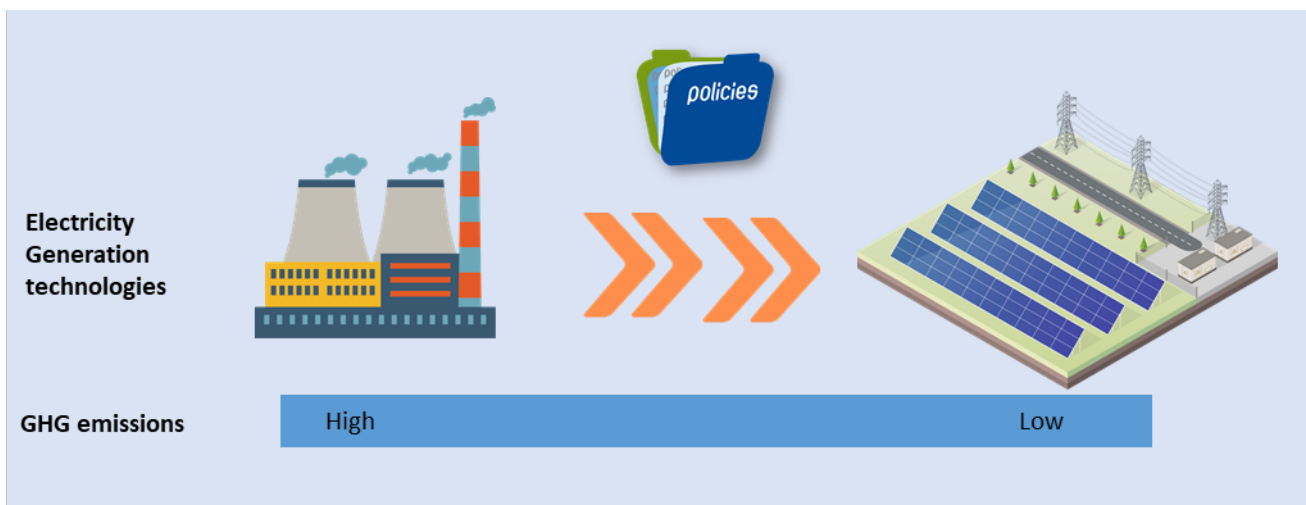
Figure 1 Overall monitoring plan