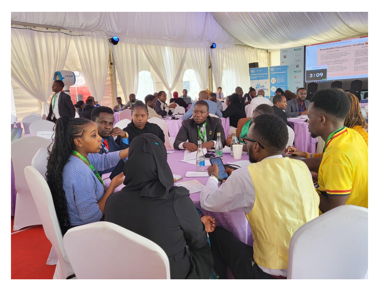
Image 1: Participants engaging in roundtable discussions, source: UNFCCC